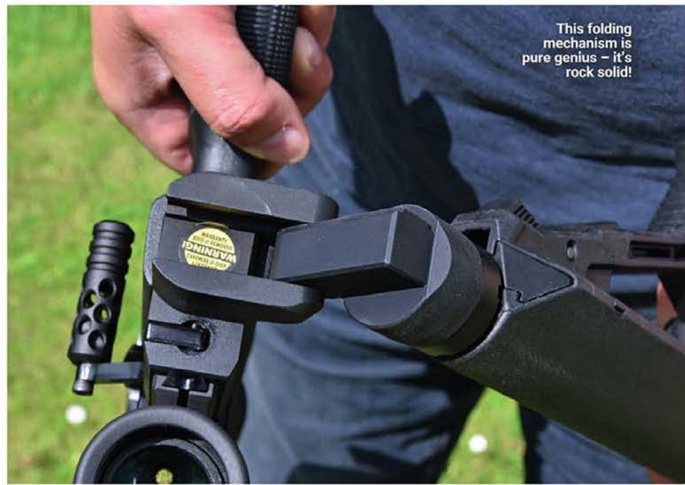
This folding mechanism is pure genius – it's rock solid!