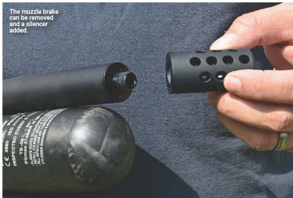
The muzzle brake can be removed and a silencer added.