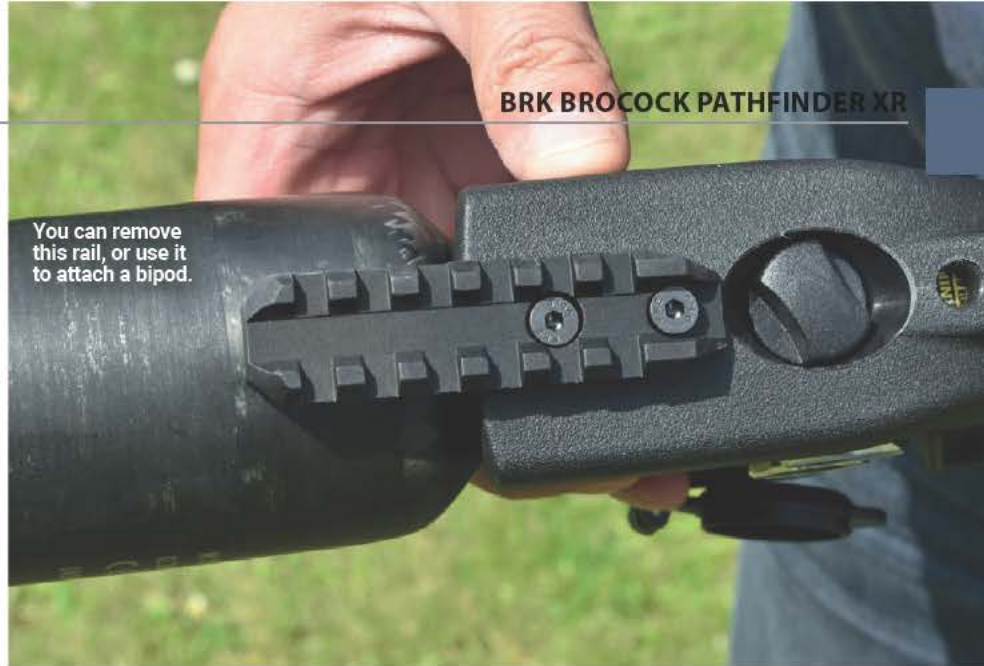
You can remove this rail, or use it to attach a bipod.

There's another 75mm Picatinny rail underneath the bottle and fore grip to attach a bipod, and this can easily be removed if required.