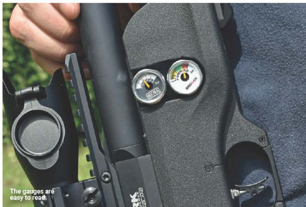
The gauges are easy to read.