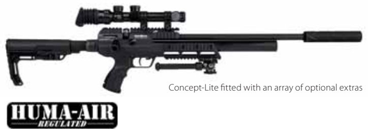
Concept-Lite fitted with an array of optional extras

Combining fast-handling ergonomics, a recoilless firing cycle and match-like adjustable trigger, accuracy is further assured via the Concept-Lite's high-grade shrouded barrel which ensures that even at its peak power output of 40 ft/lb, the Concept-Lite performs to a level that satisfies the most demanding of airgun shooters.